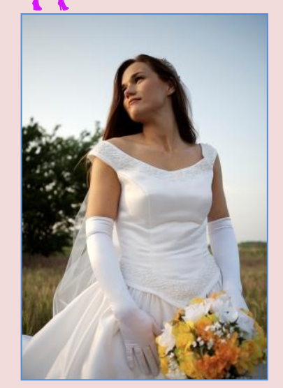
The gown above has an ill fitting bodice that gaps at the neckline. The straps also need to be shortened.

Adjustments at the shoulder or neckline may affect the entire garment. Bust points, waistlines and hems as well as embellishment placement may be affected either positively or negatively by taking up or letting out a shoulder seam. Garments should be analyzed for fit from the top down so let's start with the neckline. Gaping in necklines is common.